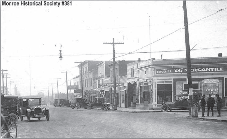
Monroe Historical Society #381

Now continue west along the south side of West Main Street until you cross Blakeley Street. Please pause here and look toward the west.